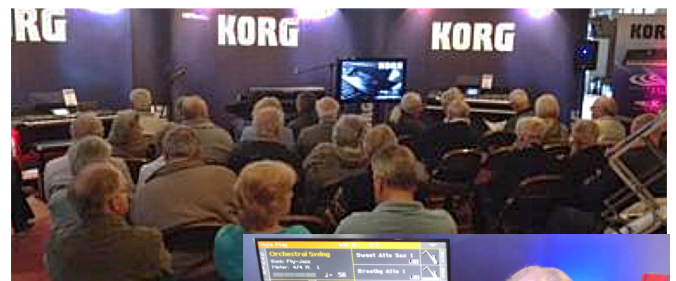
KORG Showcase and KorgSchool areas at Keyboard Cavalcade Festivals

Following those years, from 2007 I've also worked for Hammond, Nord, Orla, Roland (Atelier) and, of course, for KORG at all of the Keyboard Cavalcade Festivals for the last 10 years.