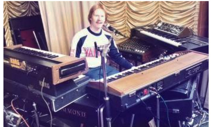
Resident Gigs - Above 1983, Below 1985

When I left my club residency back in 1984 I started learning to sing and from that I formed various duo's over the years, as cabaret acts using multi-keyboard set ups and drums.