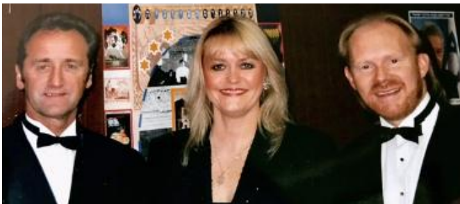
Above - Saremma Trio, Blackpool 1997 Below - With Mick Miller