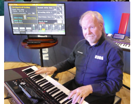
Above - Hemsby 2014 Right - Hemsby 2022