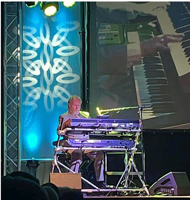
A fabulous stage setting for a concert at Das Tastenfestival in Herdecke, Germany, in October 2022.

My current set up (which changes as new models appear) is the fabulous new KORG Pa5X-76 and the incredible KORG Nautilus 88, plus Midi Bass Pedals.