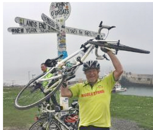
Celebrating our arrival at John o' Groats

I have had hobbies over the years, including Course Fishing, Golf, Crown Green Bowling, and I've recently taken up cycling again; in 2018 me and two friends cycled 1,022 miles from Lands' End to John o' Groats, in 14 days, raising money for children's cancer, and thanks to the organ world, friends and families, we raised just short of £5,000.