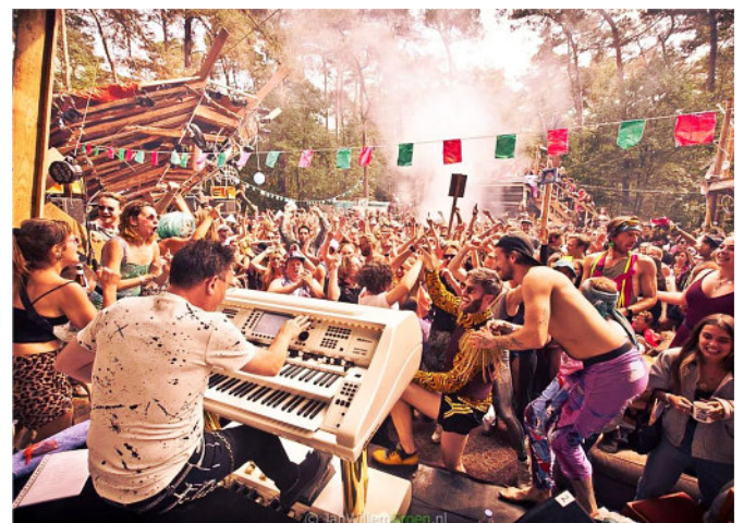
Performing at a rock festival

At those festivals I play songs from Robbie Williams up to YMCA, Final Countdown, Bohemian Rhapsody, etc... and of course... Can't Help Falling in Love with You. I still play student concerts, and now they are not only in Denmark, but also in Belgium. It's a totally different world to the traditional organ concerts.